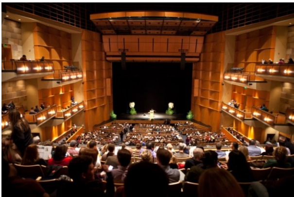
Above photo by Max Whitaker